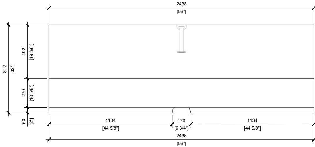
FRONT VIEW SCALE 1/20